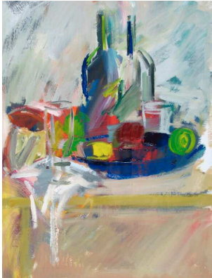
1st - Ester Chang