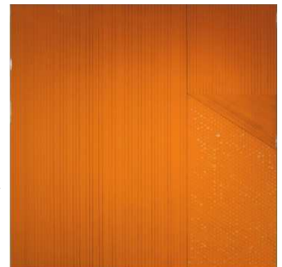
Sand T Kalloch, K-1 Orange , 46x46 inches, UV resistant industrial epoxy resin, graphite and acrylic paint on panel

large scale paintings are included in CONCEPTUAL, an exhibition of the Malaysia National Gallery of Visual Art's Permanent Collections currently on display in Gallery 1A through March 26, 2012. The National Gallery of Visual Art has collected the works of local and international artists since 1958. It's an intention of National Gallery of Visual Art to re-exhibit all the important works in its collections as reference and public viewing. National Gallery of Visual Art is located at 2, Jalan Temerloh, Off Jalan Tun Razak, 53200 Kuala Lumpur, Malaysia.