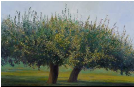
Coupling Oil painting Myra Abelson