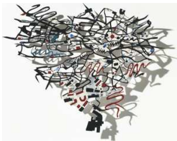
"Off the Grid"