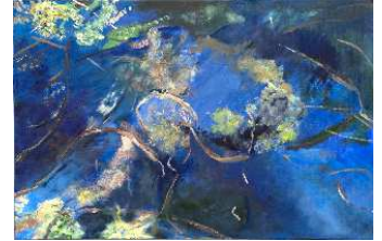
Pond Abstract by Judith Austen

Opening Reception Saturday Oct 22, 7:00 - 10pm