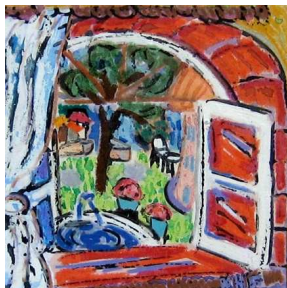
"Through My Window "