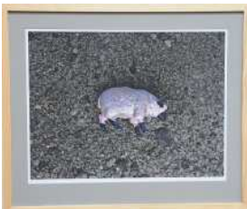
Ellen Fisher - Lost Toy