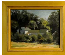
Will Kirkpatrick - Farm House on Brewer Road