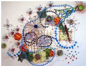
"Changing Water - Gulf of Maine "