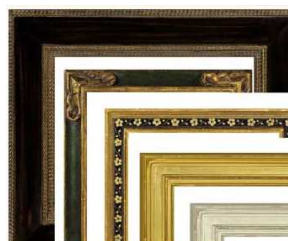
"How to Frame Your Art"