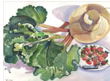
"Rondo in Rhubarb & Berries)"