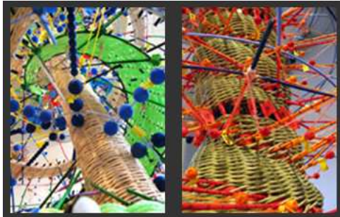
Sculpture details: "Changing Waters" by Nathalie Miebach