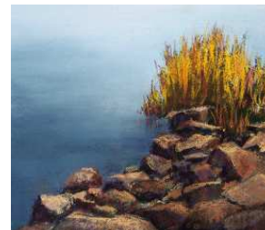
"Still Waters Run Deep "