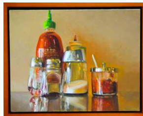
Gene Mackles - Dalat