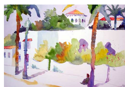
"De La Guerra Plaza"