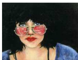
Monica Reuman Water-soluble oil