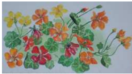
Angela Pacini Fiori