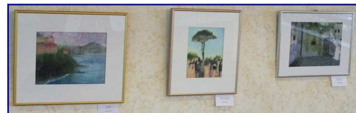
Carole Slattery's watercolors

Reception Saturday April 16th, 4:00 to 5:00 Avery Crossings, 110 West St. Needham