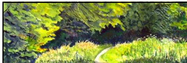
"Wellesley Path Series #3" by Carole Slattery