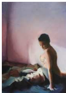
"White Light" by Alla Lazebnik