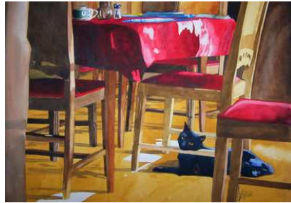
"The Sun Worshipper" (detail) by Dawn Scaltreto