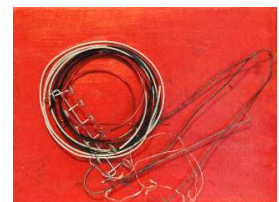
"note" 18"x24" acrylic & objects by Ellen Mulhern

In November Ellen Mulhern will display her artwork.