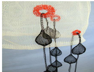
"Line of Fire" (detail) by Adrienne Sloane