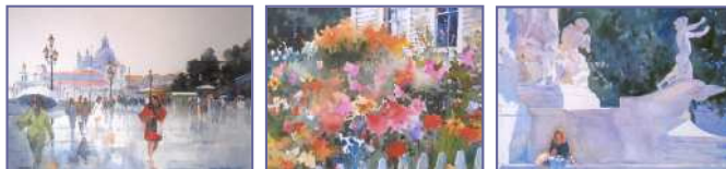
Paintings by Mel Stabin

The Newton Watercolor Society (NWS) holds monthly events on the 2nd Saturday of the month. The next Plein Air Painting get-together is Saturday morning November 13th. If the weather doesn't cooperate we'll watch a watercolor video.