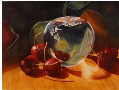
"An Apple A Day" by Marla Greenfield, watercolor on paper