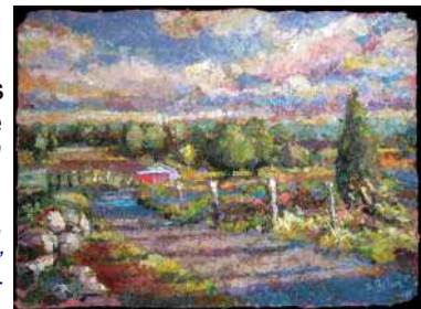
"Columbia Farm Late Afternoon" by Steve Gatter

"My medium is paper pulp painting. I discovered handmade papermaking in 1980 when I was still painting in oils. When I discovered how colored fiber, by its nature, provided such incredibly intricate and elaborate patterns when sifted or poured into a sheet, I was an instant convert. No brush or paint is applied--the color is in the fiber. My latest work consists of rural landscapes--rolling countrysides in slanting light; a study of how light and dark mark out the fences and roads that inhabit those peaceful places."