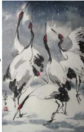
"Crane" by Chang Woo Coburn