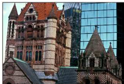
"Trinity Church Spires w/Hancock Tower" by Regina Eliot-Ramsey