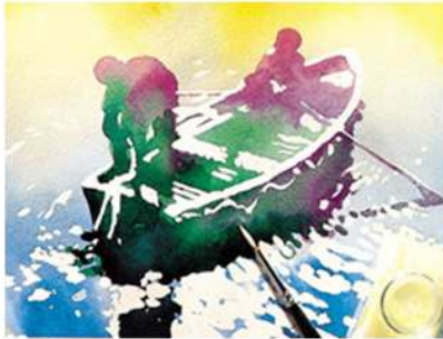
This watercolor painting uses Winsor Newton's Art Masking Fluid