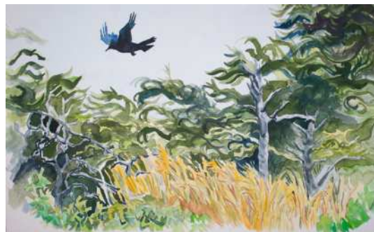
Watercolor by Wanda Metcalf