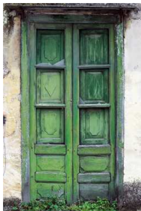
"Doors to Sicily" by John Borchard

(see some of the art from the show below & on page 2)