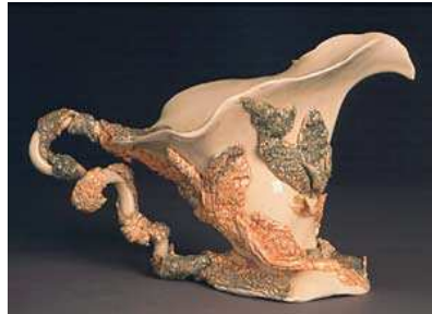
"Creamer-Gravy Boat" by Kendra D'Angora Low fire white clay, 5x8x18 1/2