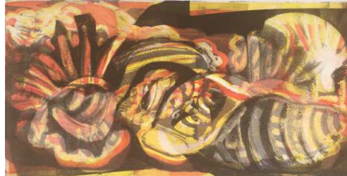
Arlene Bandes Monoprints: "Shell Landscape"