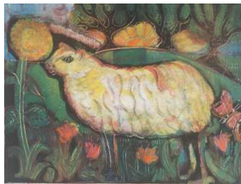
Arlene Bandes Monoprints: