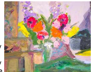
Flowers before Easel (20"x24" acrylic & oil) by Ellen Mulhern

You can see more work at her website: http://web.me.com/ellenmulhern1