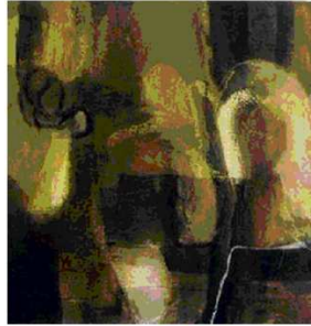
"The Amber Sunset" by Crist Filer