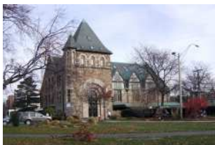
View of Newton Centre

In December we'll meet on Saturday Dec 12, 2009 at Mike Milburn's home to watch a watercolor video - 10:00 am - 12:00.