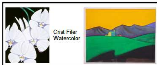
"Tulip Motif" & "Intermezzo" by Crist Filer