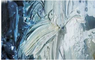
Water Mixable Oil Paint - sample